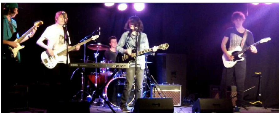
Second Year Band